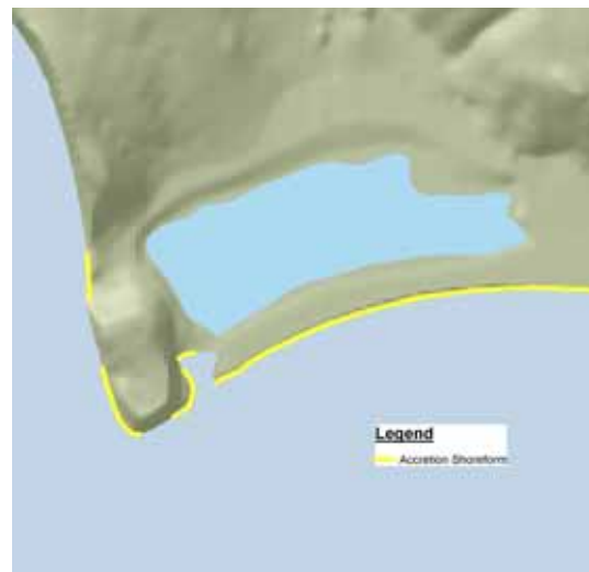
Fort Casey State Park shoreline areas that are accretionary and depend on sediment from feeder bluffs outside of park

The campground area and spit are at long term risk from predicted sea level rise associated with climate change. The sea level rise predicted for the North Puget Sound/San Juan Islands (Friday Harbor) is approximately two feet by the year 2100 (Puget Sound Action Team, 2005).