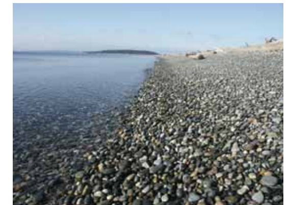
Coarse substrate on spit

The park and most of western Whidbey Island have no salmon-producing streams. However, high densities of juvenile salmon have been documented in Keystone Harbor. Surf smelt, an important "forage fish" for numerous aquatic species, including salmon, and birds, have been documented spawning on the west side of Admiralty Head. Surf smelt deposit eggs in small gravel in upper intertidal zones. Cobble substrate along the park's south-facing spit is too coarse for forage fish spawning. The coarseness is due to the high wave energy that hits the beach (long fetch to south) and could be in part due to interruption of sediment movement at Keystone Harbor. Very little eelgrass occurs along the park shoreline, but patchy overstory kelp (e.g., bull kelp ( Nereocystis leutkeana )) occurs along the west-facing park shoreline, and continuous understory kelp (e.g., sugar kelp ( Laminaria saccharina )) grows along the south-facing park shoreline.