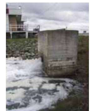
Salt water flowing into Crockett Lake through tidegate

and via the ditch at the east end of the lake. The lake's management, in particular the tide gate and lake level, has been the subject of significant study and litigation. The National Park Service is studying the historic habitat condition of the lake currently, and there is not agreement on the degree of pre-settlement tidal fluctuations, saltwater inundation, and anadromous fish use. Extensive information on the history and management of the lake is available in the Ebey's Landing National Historical Reserve Final General Management Plan and EIS (National Park Service, 2006).