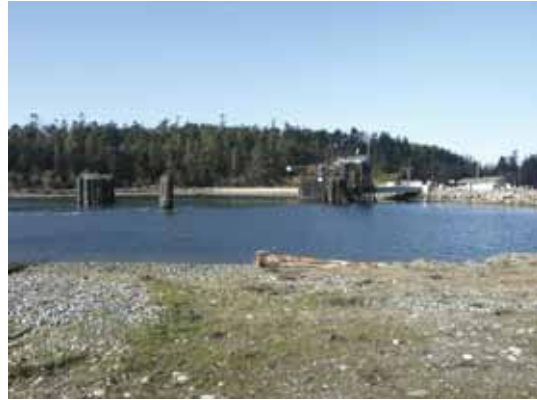
Shoreline of Keystone Harbor near WSF terminal

The lower park area, in particular around Keystone Harbor, is less conducive to a high level of habitat function because the harbor shoreline is armored with riprap and there are several active uses. Washington State Ferries operates a ferry terminal in Keystone Harbor. The future alignment of the ferry terminal is an issue that State Parks is tracking. One potential realignment scenario would require cutting back the shoreline at the RV campground. Another issue related to the ferry terminal is that run-off from the vehicle holding area flows directly into water, presumably impacting water quality.