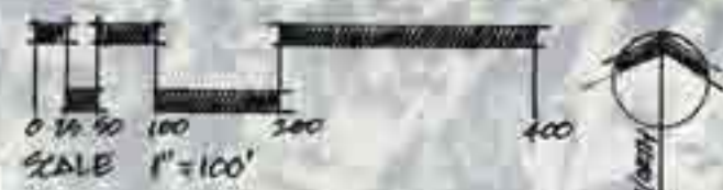
FORT WORDEN STATE PARK MASTER PLAN BCRA MAY 4, 2008 D.WRIGHT