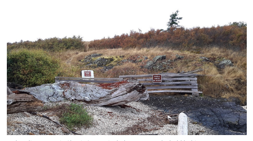
Kukutali Preserve in Skagit County includes a rare rocky bald habitat.

Water is essential to all types of habitat. More than 42,500 acres of uplands in state parks lie within 600 feet of a surface water source. The Commission manages 24,100 acres of wetlands, 2.1 million lineal feet of riparian habitat, and 15,800 acres of significant habitat supporting rare plants, animals, or both. The agency manages 1,996 acres of Natural Area Preserves and 13,173 acres of Natural Forest Areas.