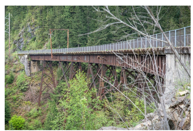
The re-named Palouse to Cascades State Park Trail includes numerous former railroad trestles.

The cross-state trails program coordinates opportunities for hikers, bicyclists and equestrians on trails that spread over hundreds of miles and that will eventually make up a cross-state, east-west traverse. The Winter Recreation program, which is funded through dedicated revenue sources, administers the state's system of sno-parks and trail grooming for non-motorized and motorized winter recreationists. The Commission also oversees the state's federally funded vessel pump out and boating programs, which includes boating safety and education, in coordination with