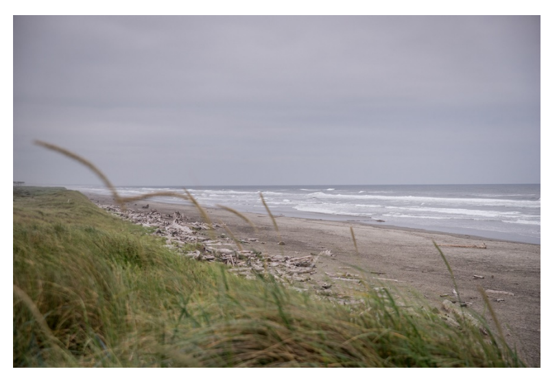
Westport Light State Park offers easy access to Pacific Ocean beaches.