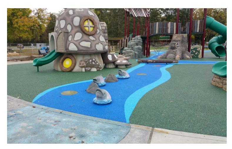
The playground at Lake Sammamish State Park, completed in 2017, meets accessibility requirements of the ADA.