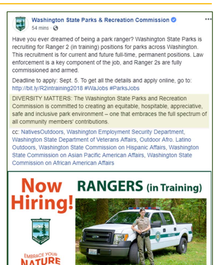
State Parks is committed to hiring a diverse workforce as is reflected in this Facebook recruitment post.

Training: To provide relevant and expected services to the public, State Parks believes it is essential to maintain a well-trained and qualified workforce. Employees are therefore encouraged to participate in