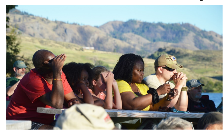
Concerts and performances at state parks draw appreciative and diverse audiences.

Diversity in our staffing and programs helps to ensure the relevance of a state park system to all visitors.