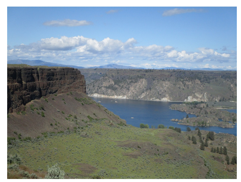
Steamboat Rock State Park gives visitors an up-close look at Washington's impressive geological history.

country. With more than 120,000 acres, the system comprises 125 developed parks, including 19 marine parks, 11 historical parks, 16 heritage sites, 13 interpretive centers and more than 400 miles of long-distance recreation trails. There are state parks in nearly every county in the state and within an hour's drive from home for almost all Washingtonians. Parks lie along rivers, freshwater lakes and Puget Sound shorelines. State Parks manages lands in mountains and along the Pacific Ocean seashore, in Central Washington's desert shrub-steppes and river gorges, and in Eastern Washington's channeled scablands and river corridors.