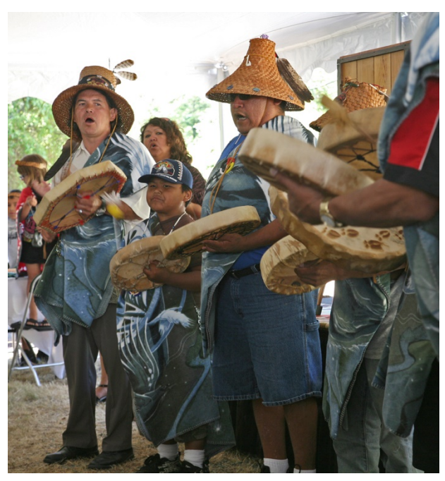
The Commission and the Swinomish Indian Tribal Community co-manage the Kukutali Preserve near La Conner.

Parks also has engaged with the Nisqually Tribe to provide trail access at Nisqually State Park. This partnership creates a venue in which the tribe can tell its story to a wider audience.