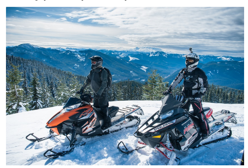
Snowmobilers get some altitude by way of Crystal Springs Sno-Park, managed by State Parks' Winter Recreation Program.

Over the years, Washington's state parks have become known as world-class locations for recreation enthusiasts pursuing such activities as long-distance kayaking, wind surfing and sailing, diving, paragliding and rock climbing. As new trends