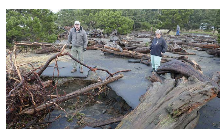
The Jan. 18, 2018 storm wreaked havoc on campsites and structures at Cape Disappointment State Park. An entire loop of campsites was closed indefinitely in 2018 due to erosion from this and other storms

Parks provide public access to the beauty of nature and exposure to the state's cultural heritage. Yet that beauty and heritage are constantly threatened. Noxious exotic plants invade park vegetation communities, urbanization spreads to park boundaries and global-scale climate alteration stresses habitats and threatens seabased infrastructure. To address these issues, cultural and natural heritage preservation efforts must be active and ongoing.