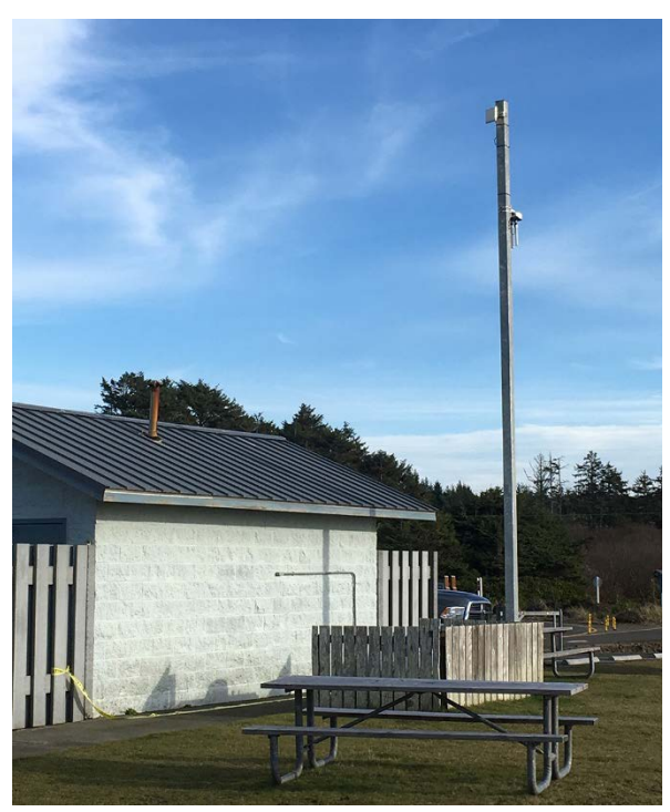
Pacific Beach State Park is one of the first parks to offer WiFi as a guest service.

State Parks is making greater use of technologies that provide customer information and services through web sites, apps and new digital platforms. Apps and web-based information can replace the need for costly, on-site interpretive displays that degrade in weather and quickly become outdated. We understand that we must compete for people's leisure time. This requires a balance – using technologies to entice visitors who want a real experience and enhancing the on-site experience for visitors, versus technologies that replace a site visit with a