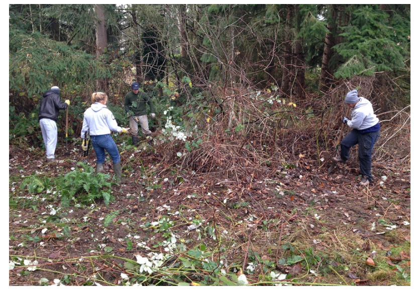
Volunteers help remove invasive Himalayan blackberries and other noxious weeds at Lake Sammamish State Park.

Staff will improve assessments and inventories and will work with volunteers, non-profit conservation organizations and other agencies to deepen its understanding of stewardship needs around such activities as noxious weed and forest health management, wildfire prevention and shellfish protection. This will lead to better restoration, protection and preservation of natural