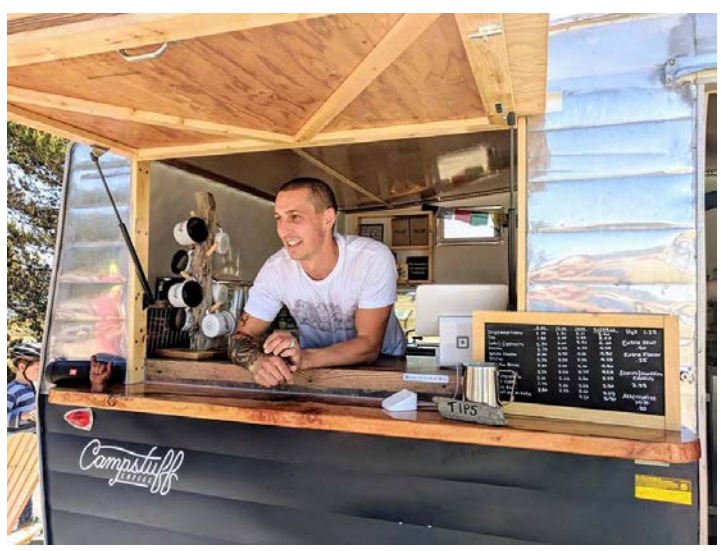
Small business concessionaire Campstuff Coffee fuels up campers and outdoor fans at Deception Pass State Park.

An example is the lease agreement State Parks signed with a non-profit, quasi-governmental entity, the Fort Worden Public Development Authority (PDA), to co-manage Fort Worden State Park. The PDA is managing the campus portion of the park, which encompasses lodging and rental buildings, while State Parks continues to manage the park's natural areas and campground. The arrangement encourages fundraising for capital development by the PDA to improve the large collection of historic buildings onsite and allows parks to focus on core activities typical to the park system.