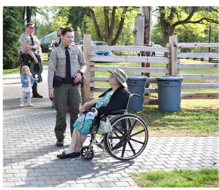
The ADA-compliant paved path at Jackson House State Park Heritage Site was installed during a major renovation to the park, completed in 2017.

Park staff respond to visitor questions, address visitor concerns, provide event and interpretive programming, conduct administrative activities such as selling Discover Passes and registering campers, and provide a safe environment in which the public can enjoy the parks. We also work to keep public facilities such as restrooms, campgrounds and picnic shelters safe, clean, maintained and welcoming.