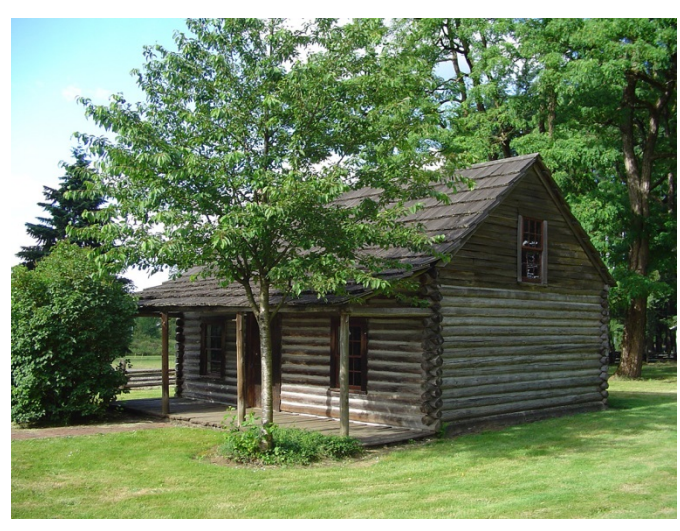
The historic Jackson House near Lewis and Clark State Park, in Lewis County.

State Parks honors the past by providing public access to sites and programs that connect people with their cultural heritage. State Parks preserves the state's most iconic and representative historic structures, sites, districts and intact cultural landscapes. Examples include historic military forts from the 19<sup>th</sup> and early 20<sup>th</sup> centuries; historic markers; heritage agricultural sites such as Olmstead Homestead and Dalles Mountain Ranch; the Jackson House territorial courthouse; Cama Beach State Park, a historic fishing resort; and Civilian Conservation Corps-era parks and park features.