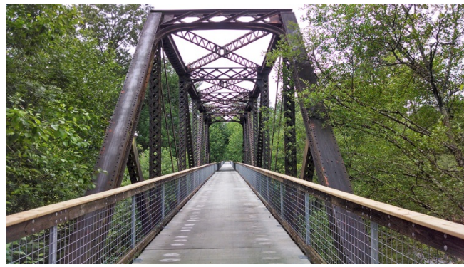
Bridge replacement: Willapa Hills Trail State Park.