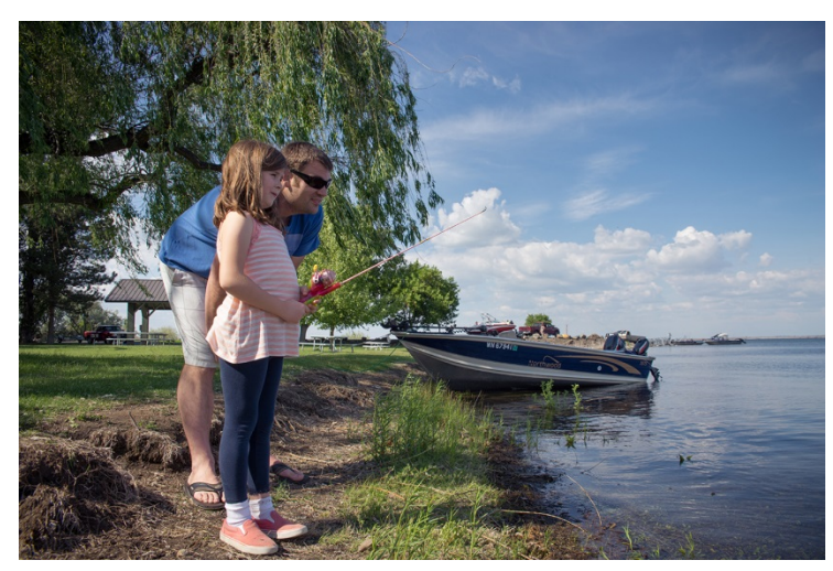
Father and daughter enjoy a day fishing at Potholes State Park, near Moses Lake in eastern Washington.

The state park system is managed by a seven-member commission of citizens from around the state, appointed by the Governor to serve staggered, six-year terms. The Commission sets policy for the system and hires an agency director, who in turn manages all aspects of agency operations.