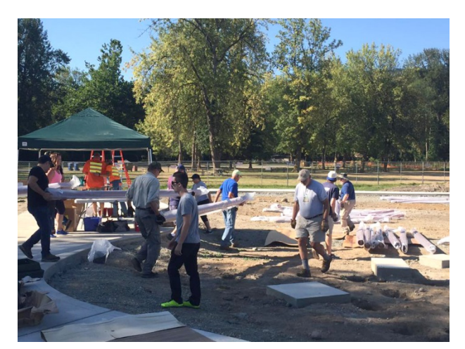
Volunteers and members of the Friends of Lake Sammamish State Park help assemble a new ADAaccessible playground.

Parks Foundation and friends groups are essential: The Washington State Parks Foundation raises public awareness and financial support for park projects and programs. Contributions include development of