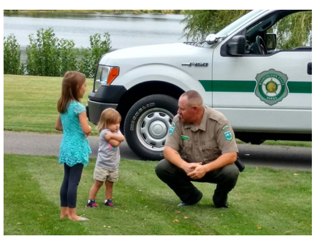
Improving customer relations is a key priority for State Parks.

More than 70 percent of the current State Parks budget is devoted to direct, on-the-ground service to park visitors. Park staff respond to visitors to answer questions and address concerns and provide programming in parks. Meanwhile, they also work to keep public facilities such as restrooms, campgrounds and picnic shelters safe, clean and welcoming. Since the State Parks operating model relies on a majority of funding to come from user fees, satisfying customer expectations in the parks is critical to the financial stability of the park system.