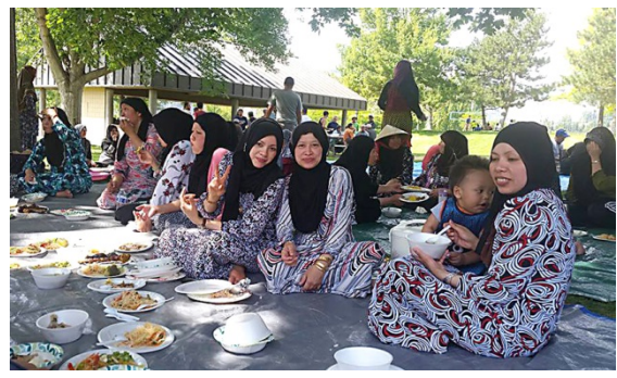
Parks are important gathering places for families and communities from diverse backgrounds.

members' contributions. The Commission makes this commitment because: