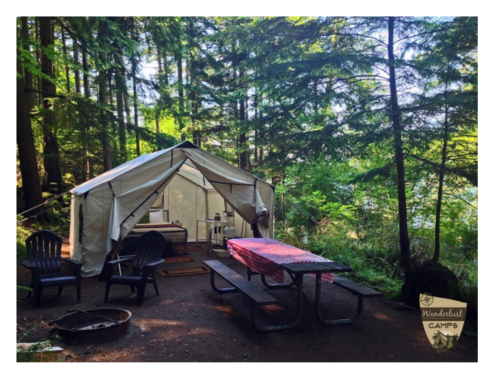
Agreements with concessionaires provide glamping opportunities at two state parks - Millersylvania, south of Olympia, and Moran State Park on Orcas Island (pictured).

The agency is cautiously and systematically exploring partnership options where mission-aligned investment and development may more feasibly be accomplished by other public or private entities. To that end, the Parks Commission is ready to initiate pilot projects for designated recreation concession areas and enterprise lands. These efforts are directed at missionaligned recreational facilities and/or programs developed and managed by the private sector within state parks. Enterprise lands are State Parks properties that have been determined inappropriate for park purposes but which have potential to generate income for park operations if developed by outside parties. In exploring these creative real estate