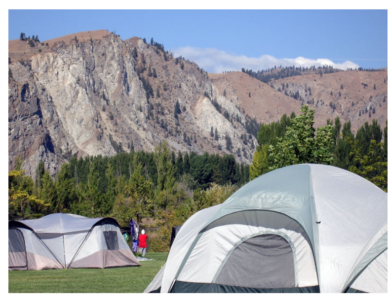
Camping at Daroga State Park near Wenatchee.

State Parks provides beautiful and inspiring venues that connect Washingtonians and visitors with the great outdoors. State Parks focuses on creating opportunities for natural heritage-based outdoor recreation, with interpretive facilities, wildlife-viewing areas and informal picnic and gathering spots for families, friends and community groups. State Parks also provides active recreation opportunities through trails and trail systems for walkers, bicyclists and equestrians. Wheelchair-accessible trails and sites encourage people of all abilities to use park trails. An abundance of water adds a "water-