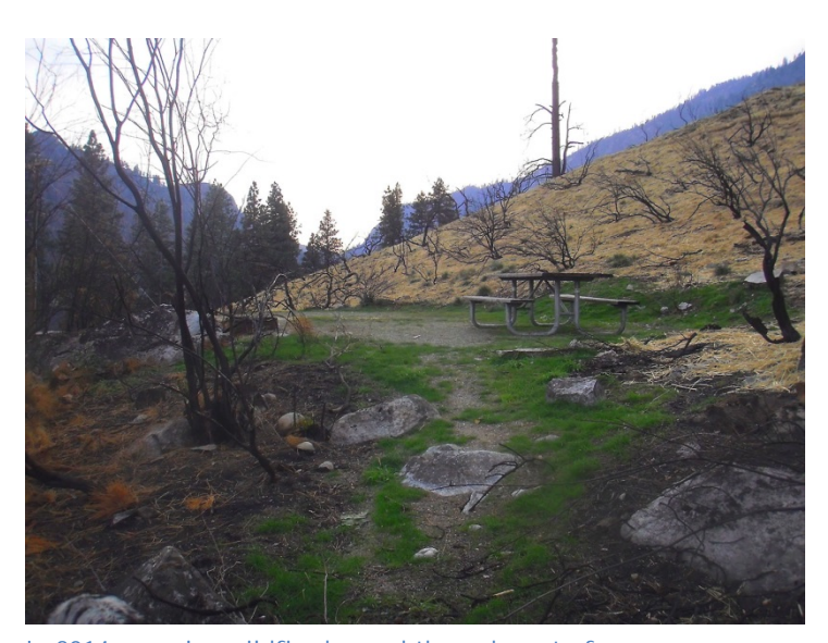
In 2014, a major wildfire burned through part of Alta Lake State Park in eastern Washington.

Unforeseen events, legislative mandates and business costs: The park system can be dramatically affected by such events as storms, fires and natural disasters. For example, storms in 2007 destroyed bridges across the Chehalis River and Willapa Hills Trail State Park, and in 2015, wildfire closed Alta Lake and several other state parks. Wildfires threaten lands and park visits every summer. Forest diseases can cause unplanned recreation closures, associated downturns in revenue, additional expenses and staffing challenges. Legislative budget provisos, biennial mandates and other unexpected obligations may limit Parks' authority and also may necessitate the re-direction